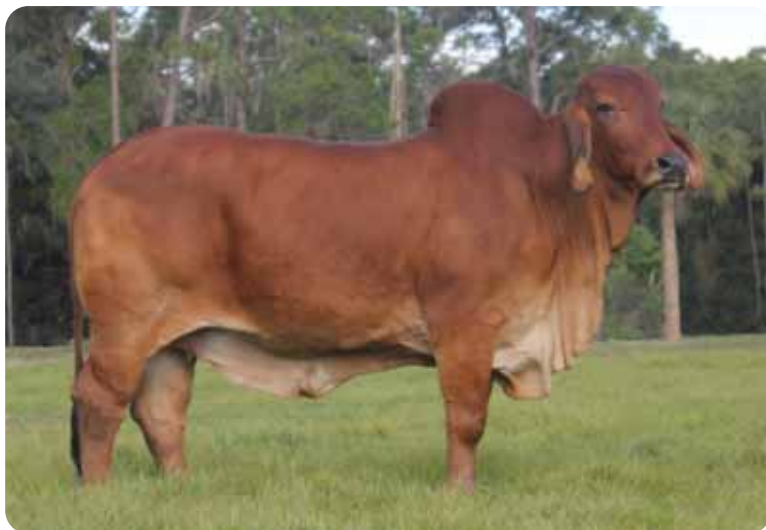
Donor BB LP Wham Bam 913

Take a look at how long and clean fronted this young female is. She is so impressive from the side angle and seems to be very level and strong down her top line. This heifer is well balanced and very desirable on the move. She is a daughter of JDH Impression Manso and from the elite donor BB LP Wham Bam 913.