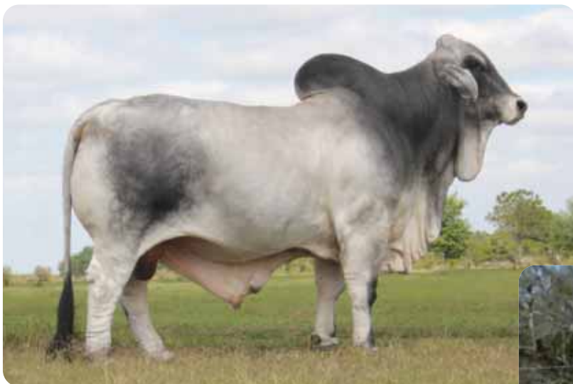
JDH Goudeau Manso 174/0, sire of Lots 59 - 61.