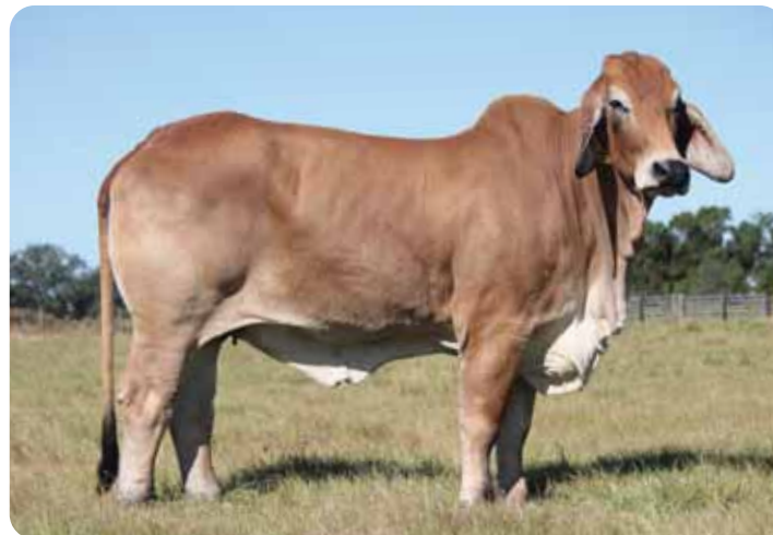
Donor TJF Ms Francene 128/9

All IVF procedures must be completed between September 4 and November 1, 2016 at Trans Ova Genetics in Centerville, Texas. Contact 866.924.4586.