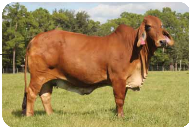
2009 National Champion Red Female