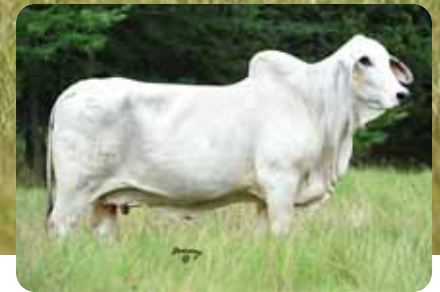
JME Ms REM Poncrata 474/6, dam of Lot 12.