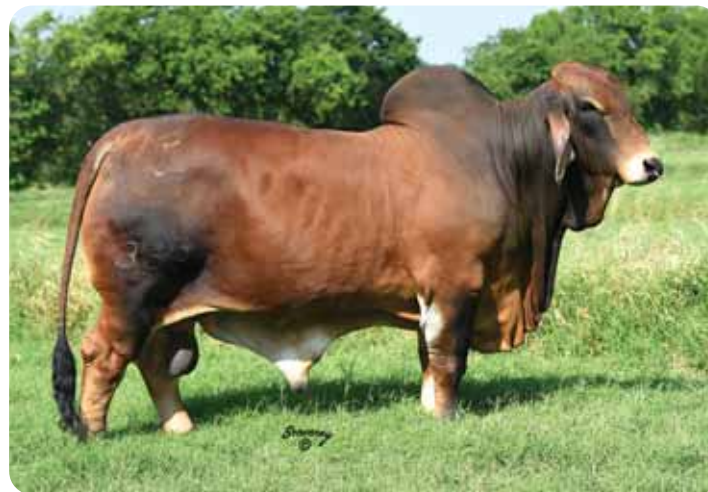
Sire Mr. Fontenot 333 "Rufus"

He has been mated to TJF Ms Francene 128/9 where we think the results are going to be spectacular.