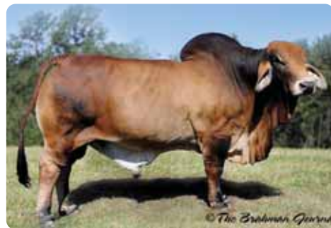
+Mr. 3X-HK Oro Rojo 800, sire of Lots 44 & 45.