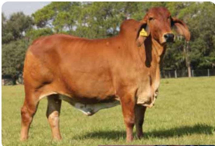
Let 13 Miss MK 4/512