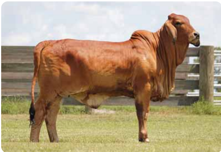
Lot 48 Moreno Ms. Lady Rebekah 30/1

48 Moreno Ms. Lady Rebekah 30/1 bw: 1.8 yw: 19 ww: 12.2 milk: 7.3 C 941976 / 30/1 / Cow / 09.03.15 / Horned / Red