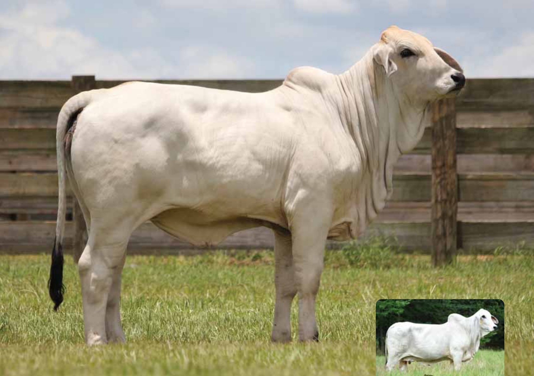
Lot 12 Moreno Ms. Polled Pauline 92/1