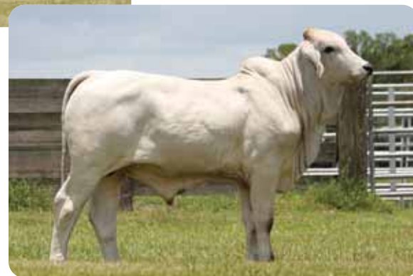
Lot 55 Moreno Mr. Imponente 605

JDH Impression Manso 719/4 is one of the greatest sires to ever exist at Moreno Ranches. He is a proven sire and one that has many progeny that are working in the J.D. Hudgins program. His dam is a big maternal and powerful broody female, sired by +JDH Charley's Jazz 946/1. 719/4 is that unique sire that combines tremendous bone, extra muscle and substance and is very calm in his disposition. Here are two daughters and two sons of JDH Impression Manso. His progeny have been sought after over the last couple of years and we think for good reason. Take a look here at these four progeny and we think you will understand why.