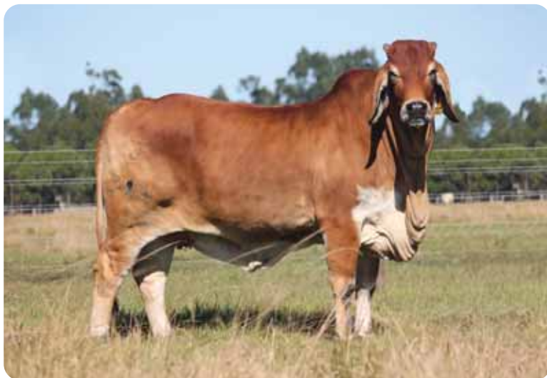
Donor TJF Miss Stunner 284/0

Wow! Moreno Ms. Lady Rebekah is a very feminine and long bodied heifer that comes from the heart of the Moreno embryo calf transplant keeper pen. She is a daughter of JDH Impression Manso and from the TJF Mr. Smokin Gun daughter TJF Miss Stunner 284/0. This heifer is very calm as you would expect and just take a look at her length of body and levelness from her hooks to pins. We appreciate her sound structure and above breed average performance. She is full of red beef!