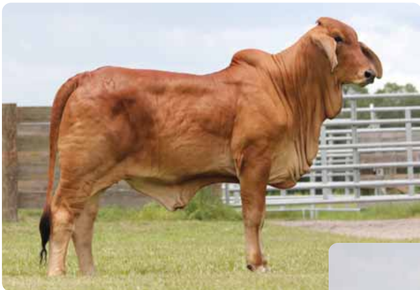
Lot 44 Moreno Ms. Lady Rebel 22/1