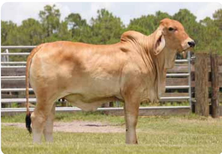
Let 14 Moreno Ms. Lady Raquel 42/1