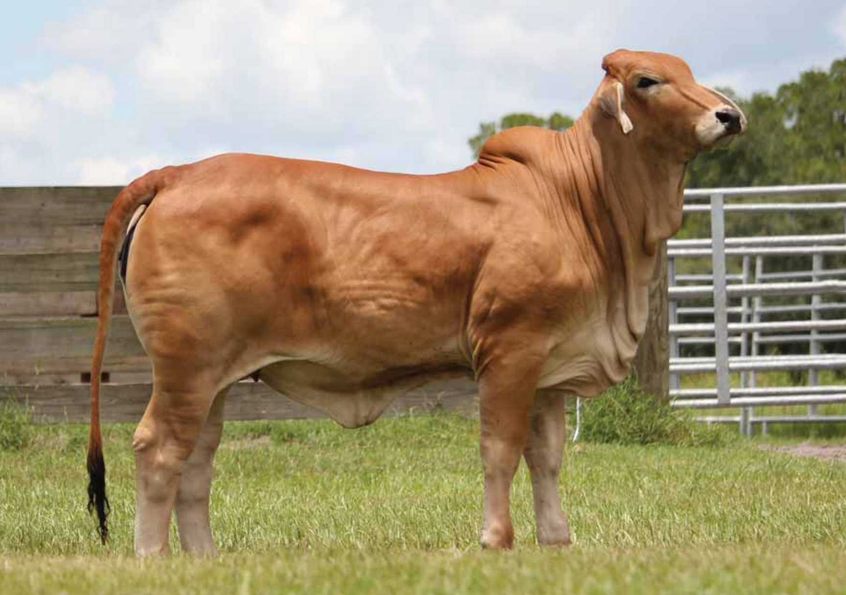
Lot 16 Moreno Ms. Lady Risitas 80/1