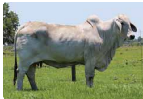
+Miss B-F 42/7, dam of Lots 46 & 47.