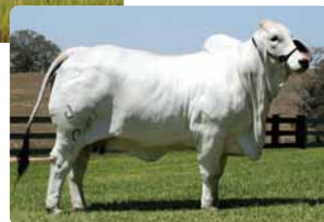
Lady H Mae Manso 66/9, full sister to Lot 41.