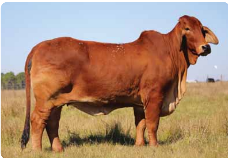
Donor TJF Miss Red Velvet 110/7