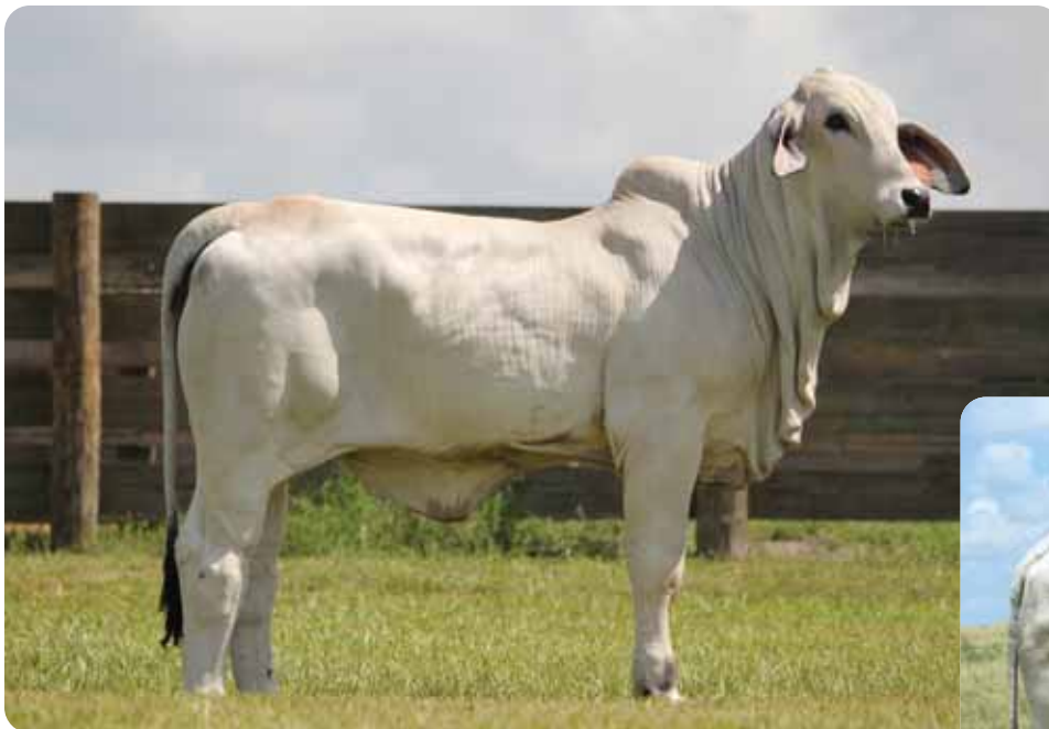
Lot 10 Moreno Ms. Polled Divia 120/1