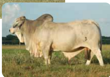
Mr. Royal K 48/8, sire of Lot 52.

Moreno Mr. Rocks is a young herd sire prospect that has tremendous rib shape and volume. He is so "cool" looking and is just puppy dog gentle. This gray bull has a massive amount of rib shape and volume. He is structurally correct and stands with a tremendous amount of bone and foot size. If you want a bull that has the power, performance and desirable conformation then consider what Mr. Rocks has to offer.