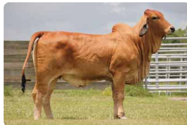
Let 29 Moreno Ms. Lady Renata 154/1

+JDH SIR LAWFOED MANSO (616/6) B 803613 SJDH LADY ELLIS MANSO (178/2) C 590390 +JDH CHARLEY'S JAZZ 946/1 (946/1) B 750937 JDH ALINA MANSO (268/3) C 779334 +MR. 3H X-RAY 825 (825) B 775361 +MISS 3-S KELLI 848 (848) C 778518 +BB MR STING-RAY 10/0 (10/0) B 804910 SRS MISS DALLAS (660) C 804841