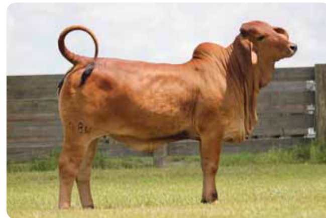
Let 28 Moreno Ms. Lady Ryan It 984

C 936841 / 984 / Cow / 08.08.15 / Horned / Red