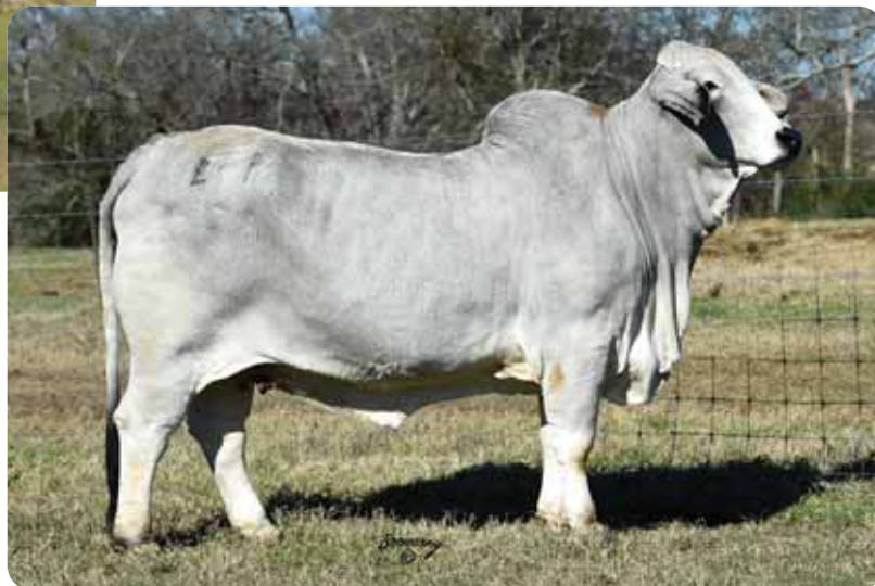
+Miss B-F 201/9, dam of Lots 59 - 61.