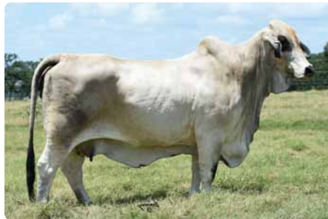
Donor Miss B-F 48/6

JDH BROSS MANSO (949/2) B 610839 S BAR MR. 166/1 (166/1) B 812681 S BAR MISS 407/7 (407/7) C 772035