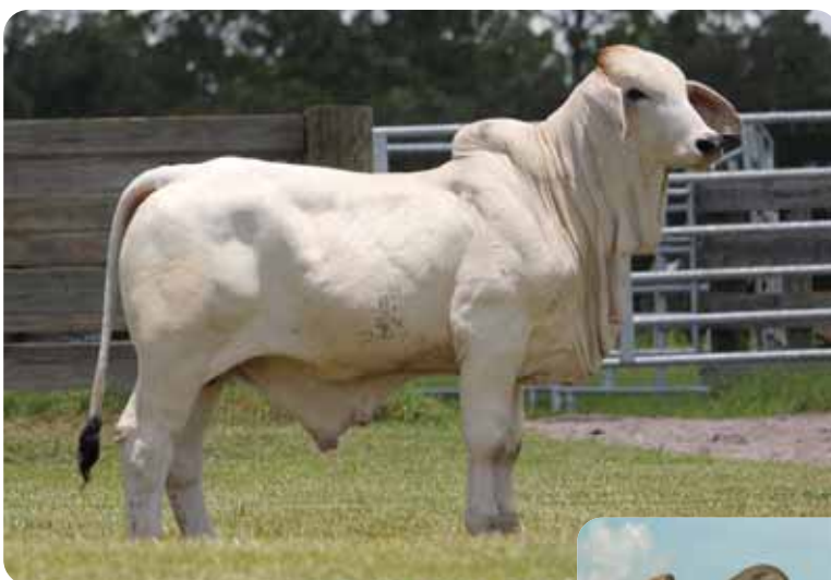
Lot 52 Moreno Mr. Rocks 597

All IVF procedures must be completed between September 4 and November 1, 2016 at Trans Ova Genetics in Centerville, Texas. Contact 866.924.4586.