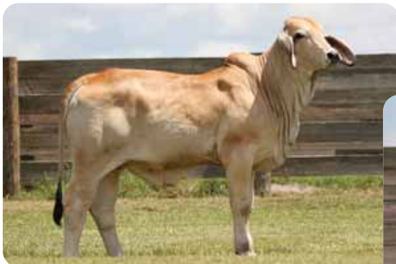
Lot 53 Moreno Ms. In It To Win It I40/I