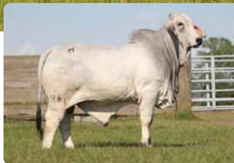
Moreno Mr Kickass 461, son of Lot 41.