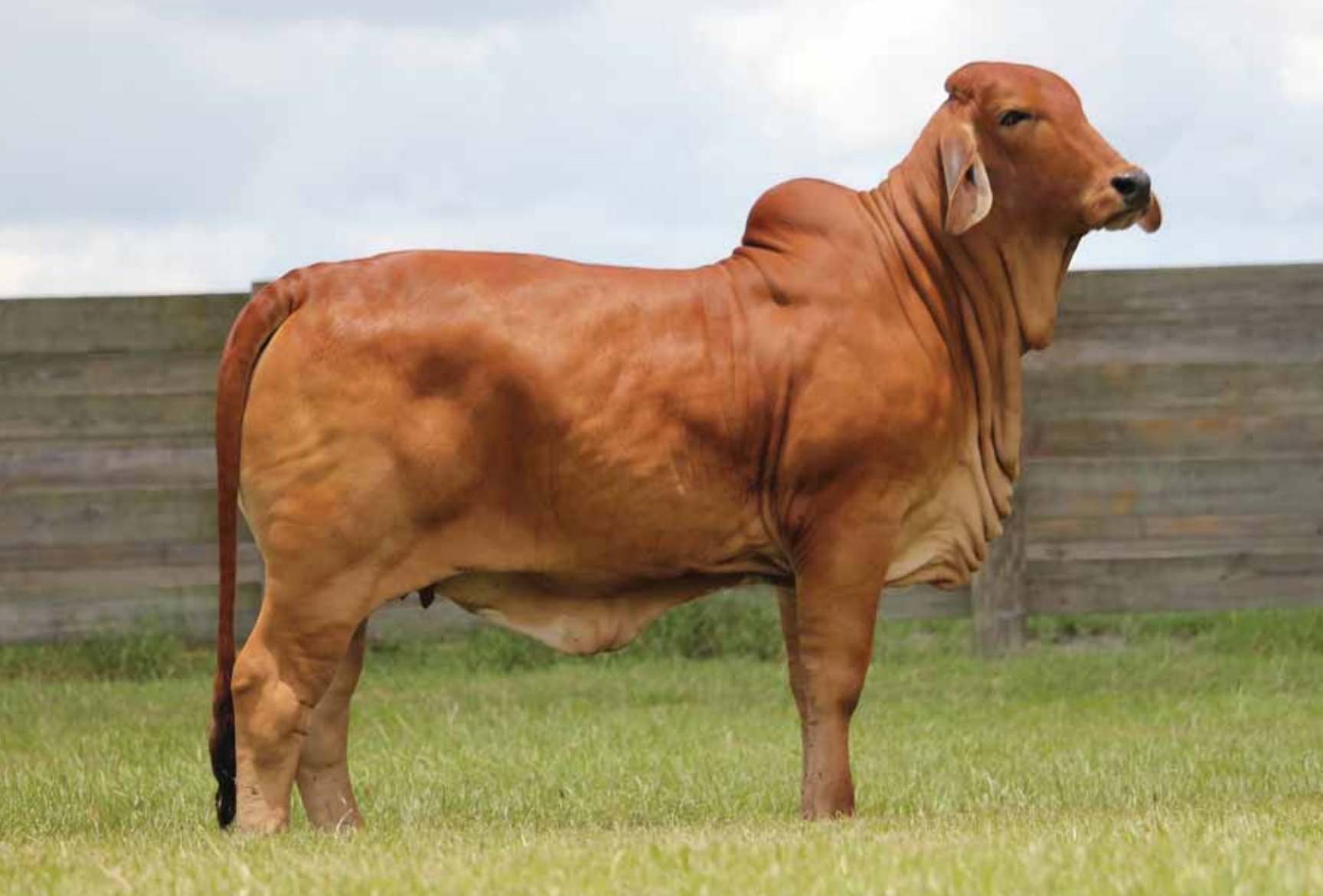
Lot 1 Moreno Ms. Lady Romy 994