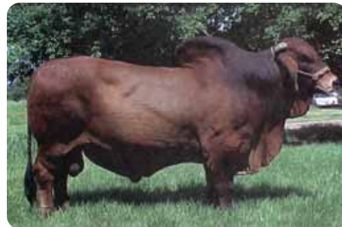
#CIGSA Mr 162/0, sire of Lot 19 & 20.