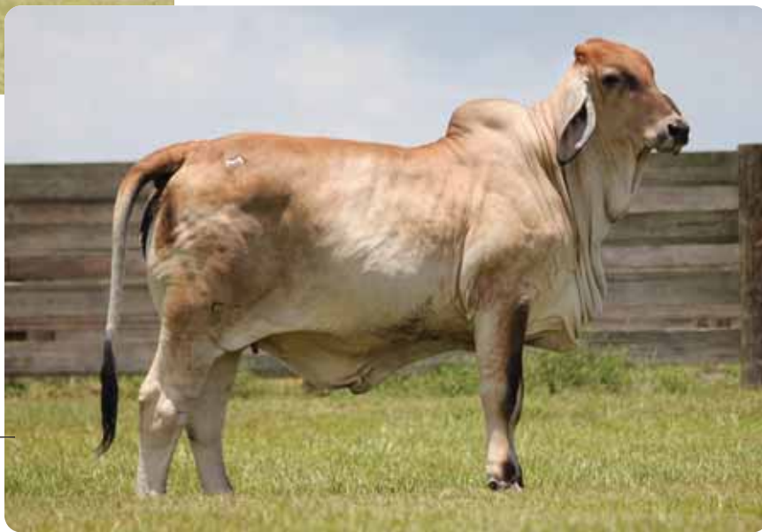
Lot 45 Moreno Ms. Lady OMG 150/1

44 Moreno Ms. Lady Rebel 22/1 bw: 1.8 yw: 19 C 942000 / 22/1 / Cow / 10.31.15 / Horned / Red ww: 12.2 milk: 7.3