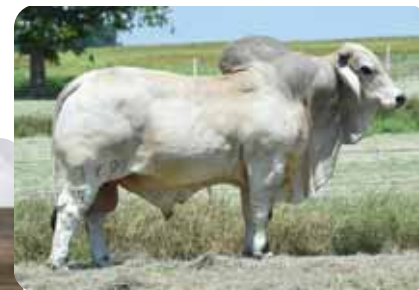
JDH Impression Manso 719/4, sire of Lots 53 - 56.