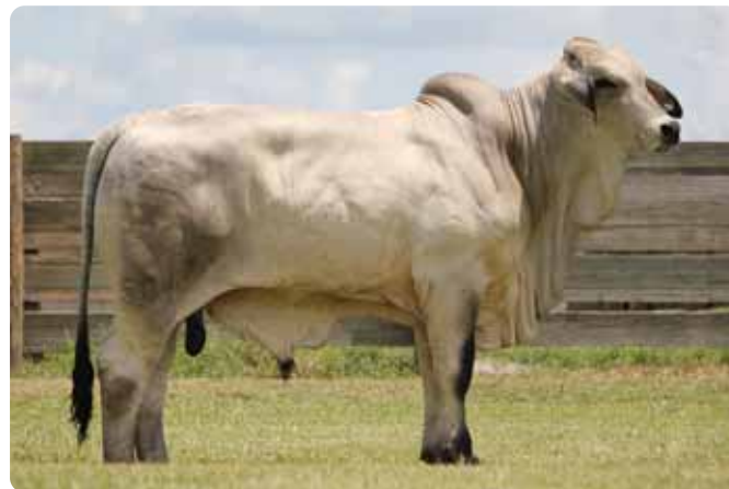
Lot 24 Moreno Mr. Power Honk 501

+MR. V8 777/4 (777/4) B 722181 +MISS V8 666/3 (666/3) C 630122