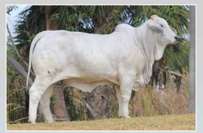
LOT 12. MORENO MS. LADY TESSIE 362