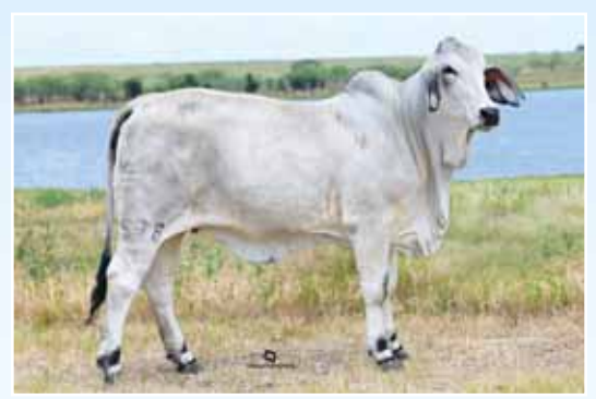
LOT 29. MORENO MS. LADY FAYE 578/1