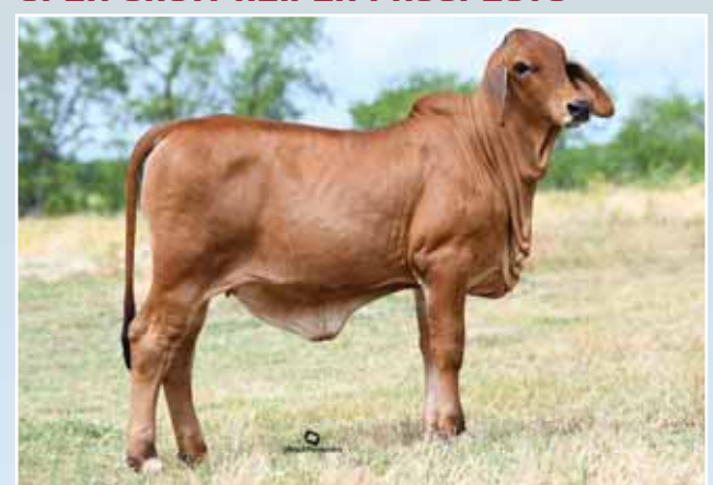
MORENO MS LADY RUBIA 870/1, FULL SISTER TO LOTS 13 & 14.