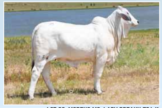
LOT 28, MORENO MS. LADY BREANN 786/1