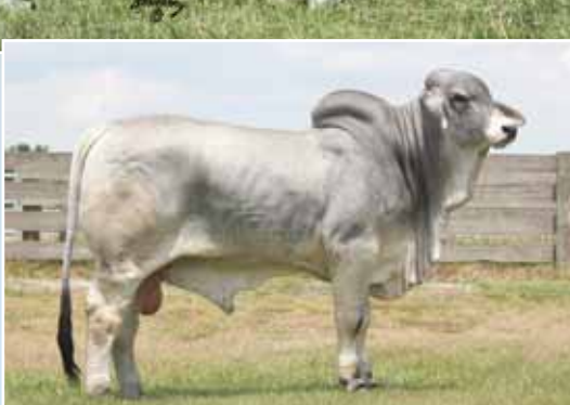
MORENO MR POWER IT 685, SON OF LOT 43.

LOT 44A - 88/2, heifer calf, born 6.08.18, gray, sired by JDH Mr Kabram Manso 434/8