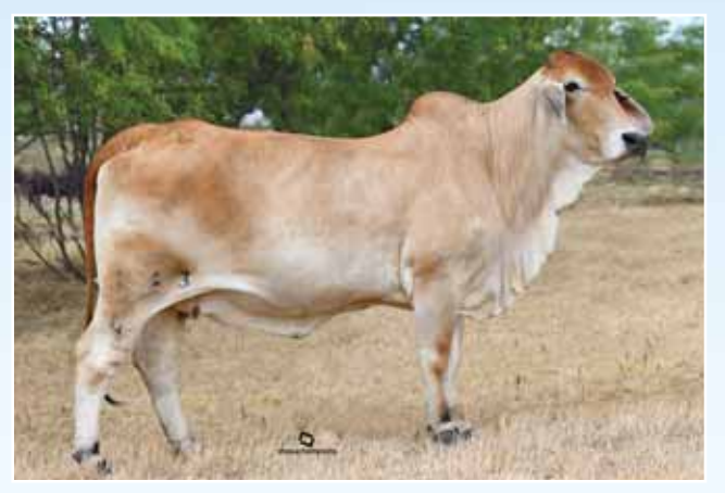
LOT 50. JDH MISS BOOTH MANSO 583/4