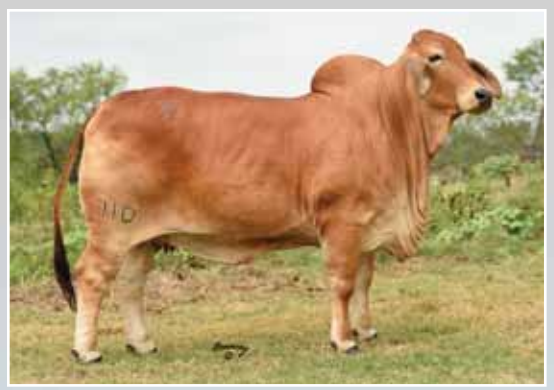
MORENO MS. LADY RUMBERA 710, DAM OF LOTS 17, 18 & 19.