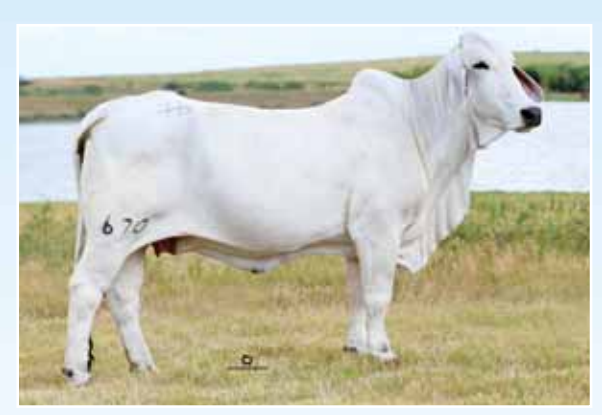
LOT 55, TTT MS SUVETTE MARTI 670