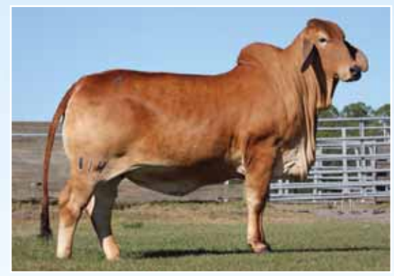
MORENO MS LADY ELSA 814. DAM OF LOT 26.

If you are studying this offering carefully you are likely seeing some trends and certain genetic lines that are working consistently. There is no question that +JDH Elmo Manso crossed on the +HK 557 cow has been outstanding producing the 2017 International Champion Bull and 2017 ABBA Show Cow of the Year. The dam to Felsia is the result of this same mating. Likewise the crossing of the 2016 International Champion Mr. Fontenot 333 "Rufus" on this line of females has yielded outstanding results with the offspring being some of the highlights of this sale. In the registered seedstock business the name of the game is consistency and genetic lines. There is no doubt that Moreno Ms. Lady Felsia 840/1 combines both of these in an attractive package.