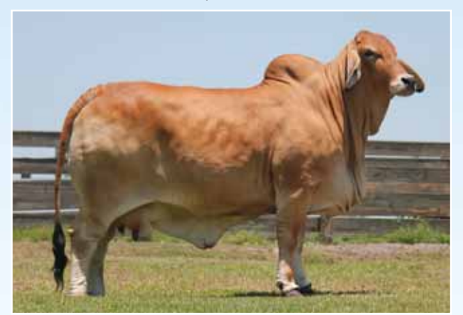
MORENO MS. LADY RITMO 712. DAM OF LOTS 13 & 14.