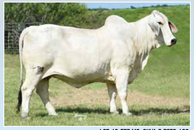
LOT 49, TTT MS. SUVA D ESTO 488