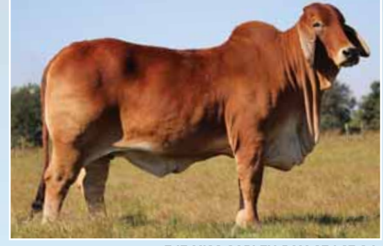
TJF MISS CARLEY, DAM OF LOT 24.

If you are studying this offering carefully you are likely seeing some trends and certain genetic lines that are working consistently. There is no question that +JDH Elmo Manso crossed on the +HK 557 cow has been outstanding producing the 2017 International Champion Bull and 2017 ABBA Show Cow of the Year. The dam to Felsia is the result of this same mating. Likewise the crossing of the 2016 International Champion Mr. Fontenot 333 "Rufus" on this line of females has yielded outstanding results with the offspring being some of the highlights of this sale. In the registered seedstock business the name of the game is consistency and genetic lines. There is no doubt that Moreno Ms. Lady Felsia 840/1 combines both of these in an attractive package.