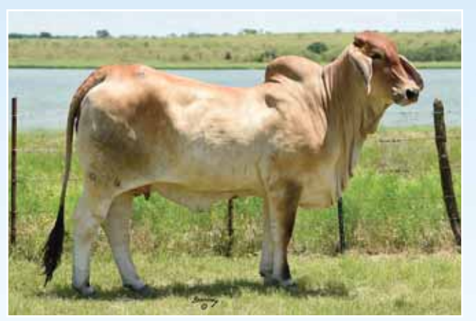
LOT 59. MORENO MS. LADY REN 976

Flushmate to the 2018 International Champion Female! You read it right, we are offering a full sister to Moreno Ms. Lady Redi 902. Not only does Lady Ren share the genetics of the "Triple Crown" Winner but ranks in the top of the breed for seven traits. It is a rare opportunity to purchase a flushmate to an International Champion but even more special when she is sired by a proven National Champion sire. There will be a lot of marketability of the offspring from this top female.