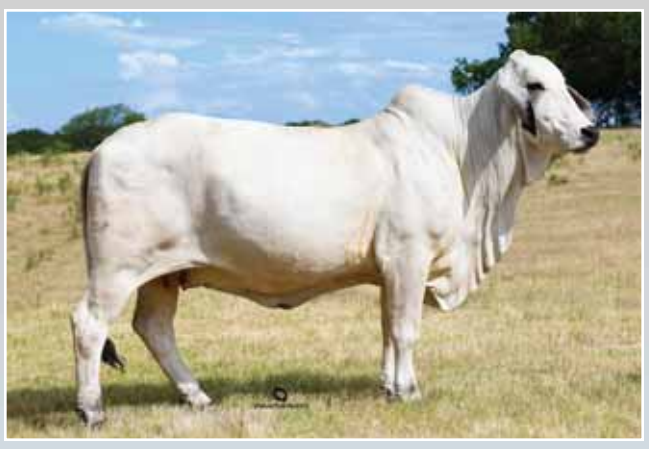
LOT 48. TTT SUVETTE MARTI 490