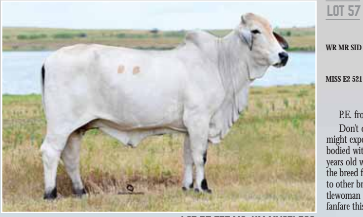
LOT 57. TTT MS. KM MYSTI 590