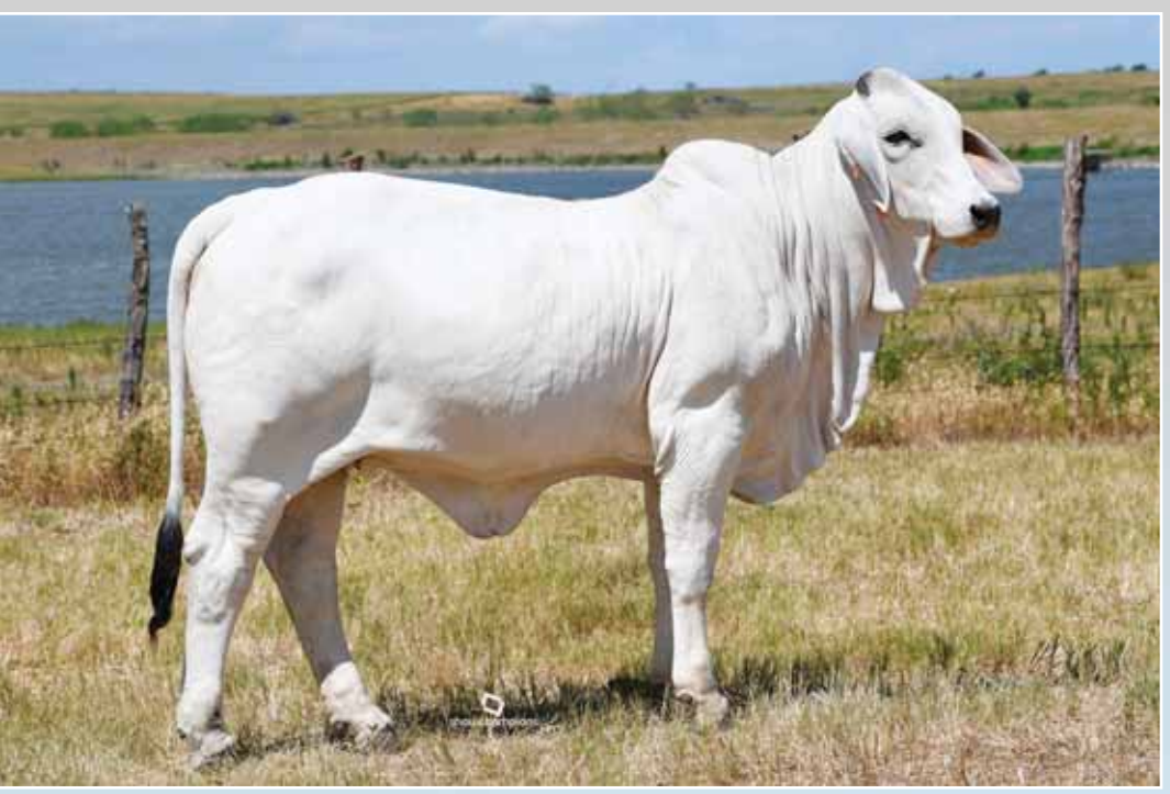
LOT 27. MORENO MS. LADY KRAKOW 792/1